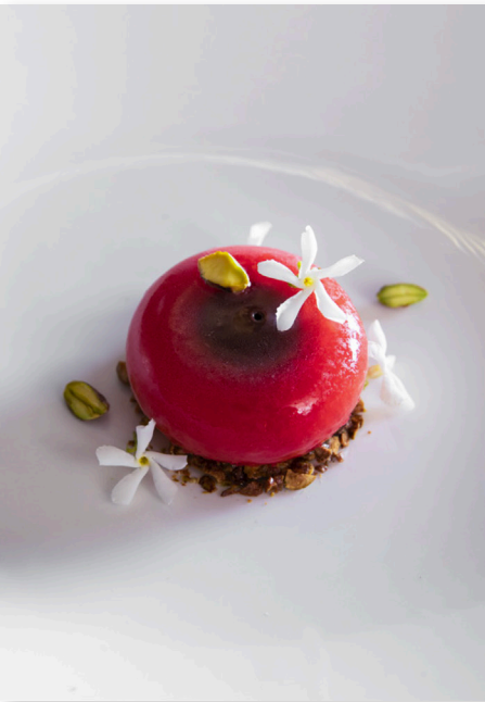
Watermelon jelly cake