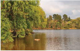
Aura Vale Lake with reflections of the Cardinia Reservoir Dam wall