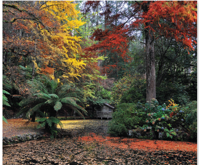
Opposite: The wooden bathhouse

Flowers are the music of the ground. From earth's lips spoken without a sound.