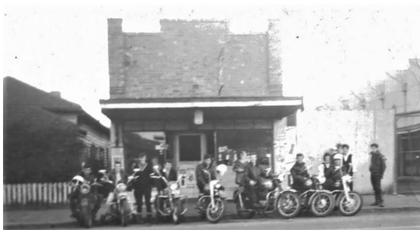
top: The Angels gather outside Mama's Milk Bar on the corner of Eleanor and Barkly Streets, Footscray. middle: Tortoise and Meat Loaf on the Countdown set, 1978.