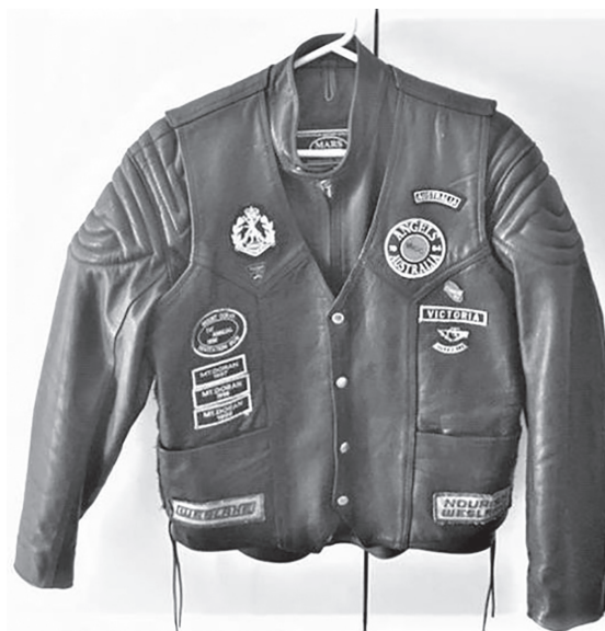
David's jacket may have been hung up, but he remains an Angel.